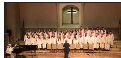
Spring Hill Singers Homecoming Concert Sunday, June 24 at 11:00 a.m. Sanctuary