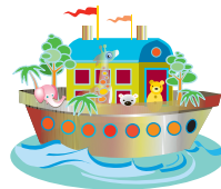
Train up a child in the way he should go; and when he is old, he will not depart from it. Proverbs 22:6