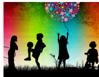
Train up a child in the way he should go; and when he is old, he will not depart from it. Proverbs 22:6