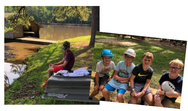
Children's Lake Forest Ranch