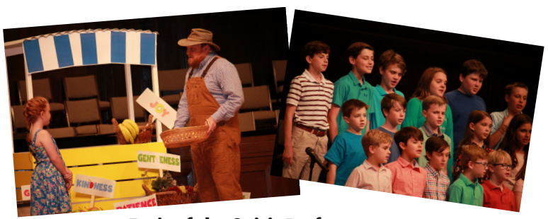
Fruit of the Spirit Performance