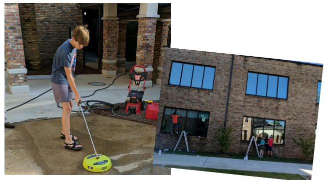
Student Mission Project