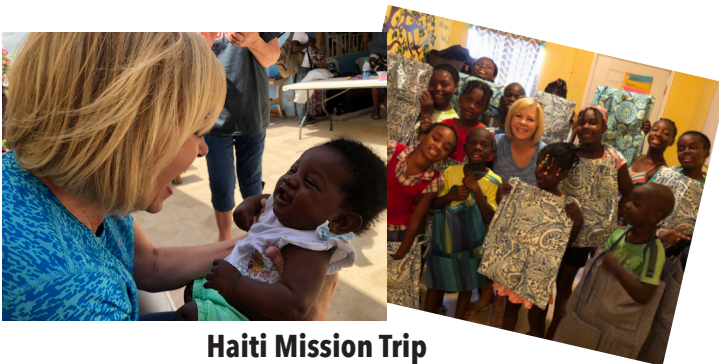
Haiti Mission Trip