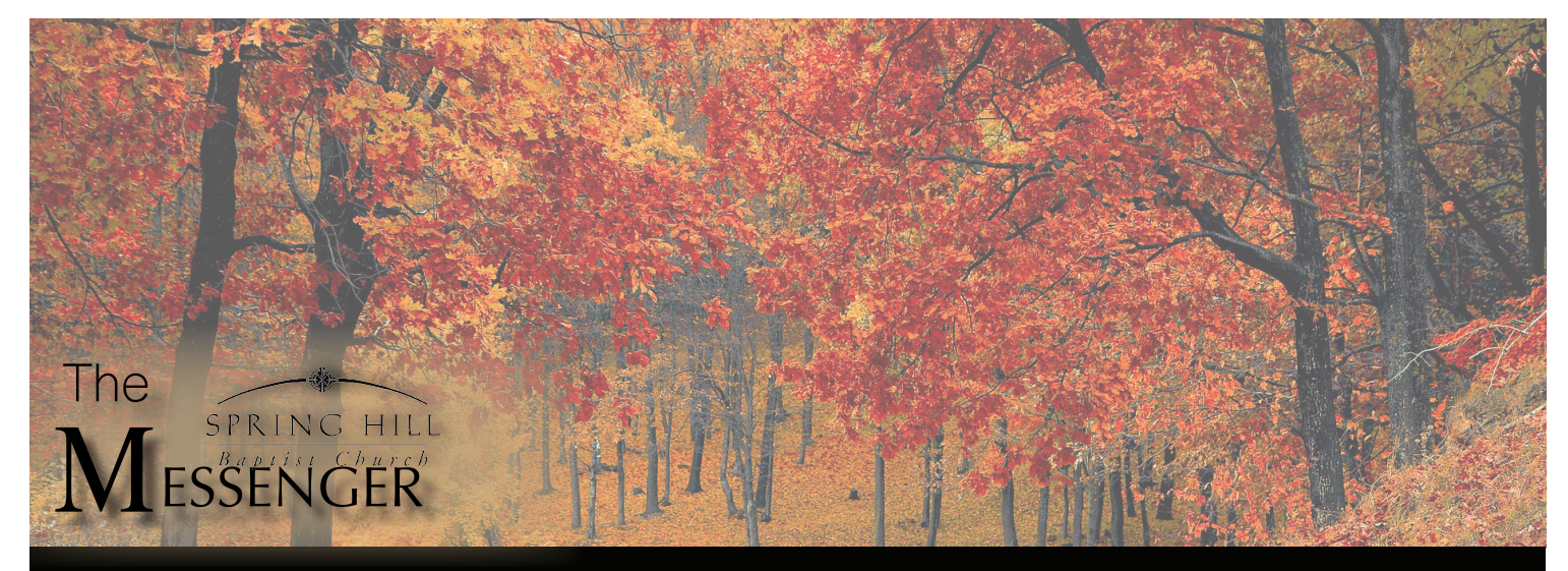
October 3, 2019 Love GOD | Love EACH OTHER | Love THE WORLD