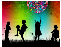
Train up a child in the way he should go; and when he is old, he will not depart from it. Proverbs 22:6