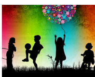
Train up a child in the way he should go; and when he is old, he will not depart from it. Proverbs 22:6

In case of emergency over the weekend, you may reach the minister on call at 342-5320.