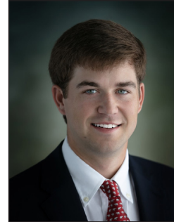
JP Cave UMS-Wright