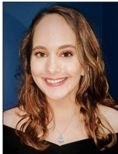
Sicily Hardy Murphy High School